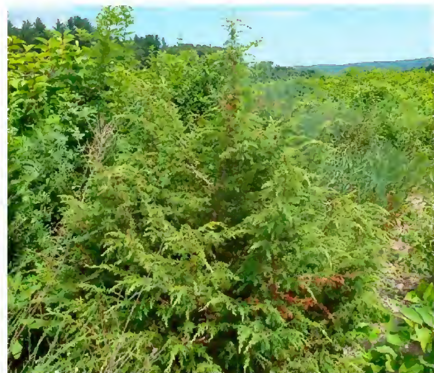
Fig. 11. var. depressa , Charlemont Isl., Deerfield River, MA